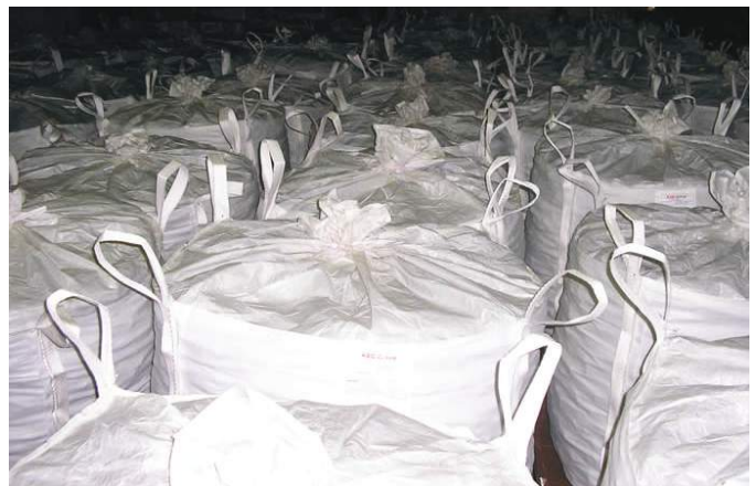
This contour map (left) shows the density of Indian meal moths in a seed warehouse. Infested in bound super sacks of seed corn (above) were stored near the right wall.

For more information on how to start a pheromone trapping program, a pheromone mating disruption program, or a fumigation program, contact Pete Mueller at tel. 309.830.9386 or p.mueller@fumigationzone.com , www.fumigationzone.com