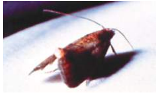
Indian meal moth.