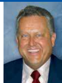
By David Mueller, BCE President

The disadvantage of ProFume is that it is more expensive and it needs more specialized equipment and training than phosphine. The other disadvantage is that the sulfuryl fluoride ProFume, fumigant is a