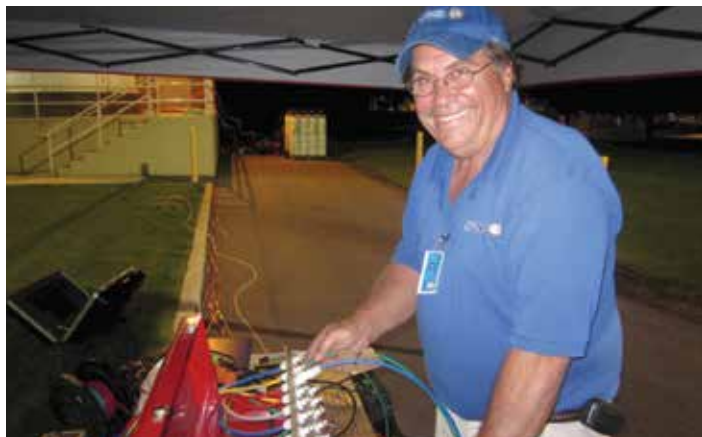
Clearing a seed warehouse that has been fumigated with ProFume (sulfuryl fluoride) takes skill and patience.

Safety is increasingly important in any contracted work on the property of a seed or grain company. Accidents can be prevented with proper training, equipment, supervision, and documentation. Today’s fumigator needs to understand your safety policies and provide the proper training, equipment, supervision, and documentation to ensure accident-free jobs.