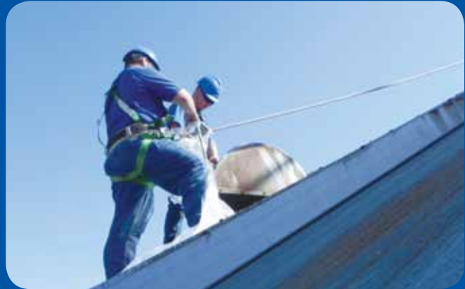
Non-confined space fumigations need to be sealed from the outside. This includes the roof vents and the eaves. Boom-lifts are often used to reach these heights safely.